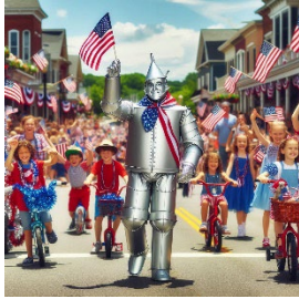
Department of Missouri VFW Auxiliary